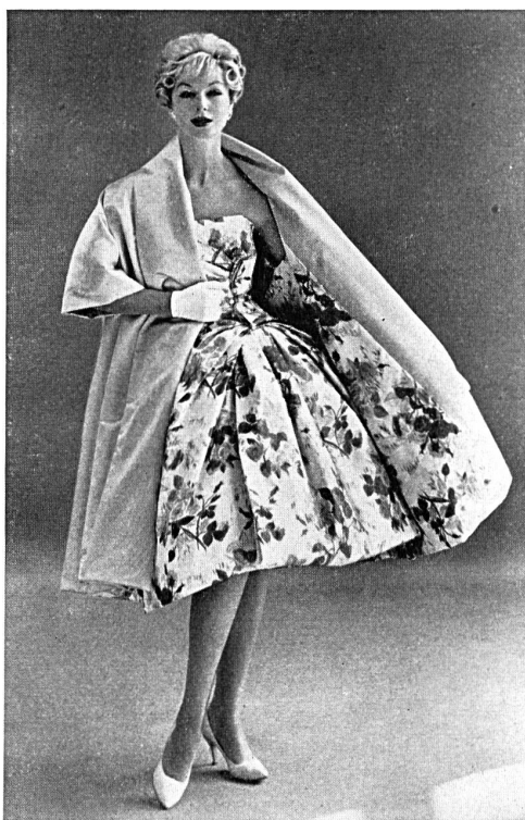
L. ABRAHAM & CO. SILKS LTD., ZURICH

Silk embroidered organdy (top), silk taffetas with silk organdy over the taffeta (skirt) Organdi de soie brodé (blouse), taffetas de soie recouvert d'organdi de soie (jupe) Modèle Werlé, Los Angeles