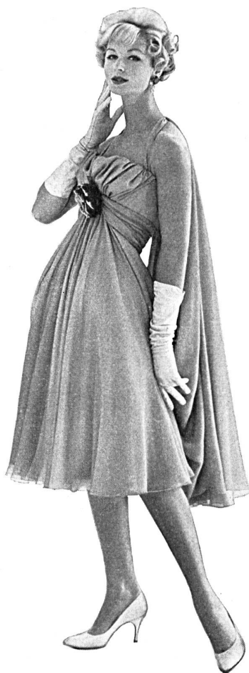
L. ABRAHAM & CO. SILKS LTD., ZURICH

Silk chiffon Chiffon de soie Modèle Werlé, Los Angeles