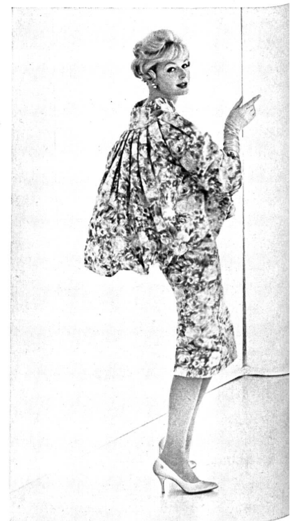
L. ABRAHAM & CO. SILKS LTD., ZURICH

The House of Werlé has specialized from the beginning in fine, imported fabrics that give its fashions a unique flavor combined with the « je ne sais quoi » of California styling. The resulting success has confirmed this designer in his policy and has resulted in increased purchases from abroad with a large part of its total coming from