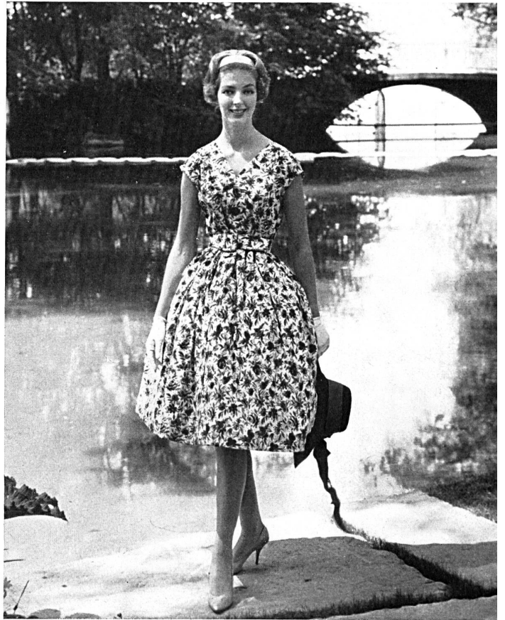
Summer dress in a printed Helanca knitwear material. MODÈLE «ISA», JOS. SALLMANN & CO., AMRISWILL