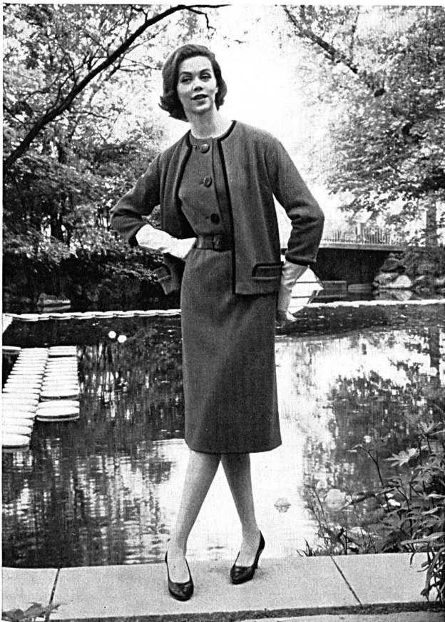
Two-piece outfit in mixed Helanca and wool knitted herring-bone material. MODÈLE VOLLMÖELLER S. A., USTER