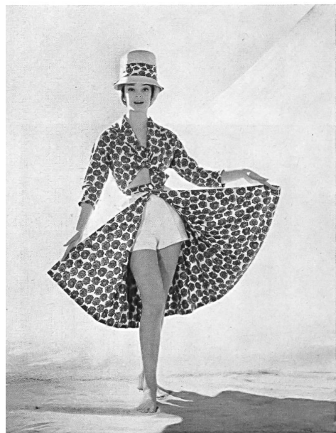
A. BLUM & CO, ZURICH

Beach outfit Tissu / fabric / tejido / Gewebe : Schweiz. Decken- & Tuch- fabriken Pfungen-Turben- thal A.-G., Pfungen