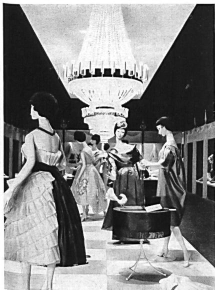
View of the „Madame- Monsieur” exhibition.

year, with a number of collective thematic displays alternating with individual stands forming part of a general scheme. From these the visitor will be able to gain a very good idea of what the knitwear industry has to offer.