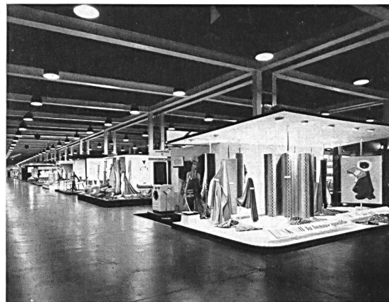
Some of the stands in the textile halls.

The success met with last year by the „Knitwear centre” encouraged its organisers to repeat the idea this