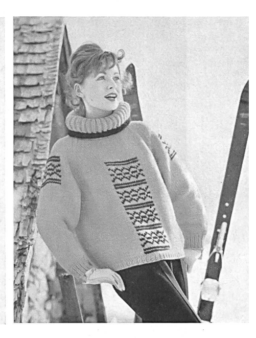
Junior price: orange and black pull-over

The Swiss are often heard to say that knitting is one of their national sports. We do not know whether other nations make the same claim, but there is no denying that there is certainly a grain of truth in the saying. Actually Switzerland played quite an important role in the development of hand-knitting because it was this country that first had the idea of knitting stockings on five needles instead of two; the first fully-fashioned stockings were put on the market here in 1560! At this early date knitting was an essentially masculine occupation. Even today there are men who knit, because they like to, for lack of something better to do or quite simply as a means of relaxation, and to judge by the results they do not do so badly: a man won second prize at the last Swiss handknitting competition organised jointly by the Zurich