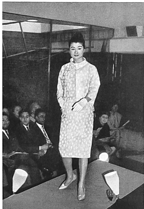
GUGELMANN & CIE S.A., LANGENTHAL

Tissu fin de coton tissé couleurs Fine cotton colour-woven Algodón fino tejido en colores Feines Baumwoll-Buntgewebe Modèle Hugo Brandeis S.A., Zurich