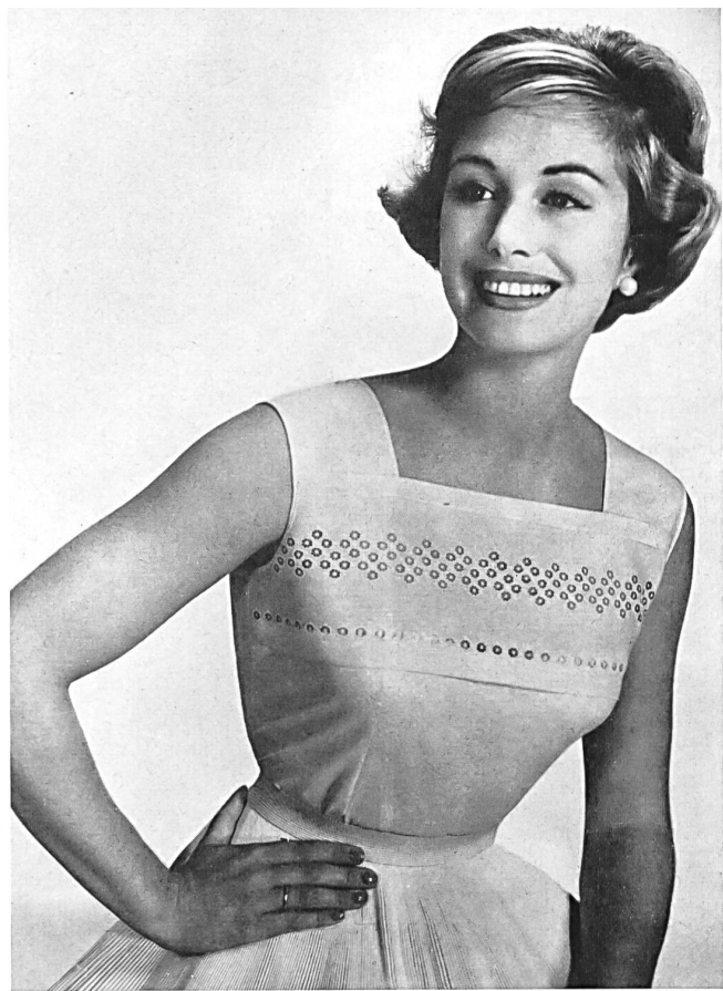
Modèle Ersä, Saarbrücken

Modèle Wollenschläger & Co. G.m.b.H., Baden-Baden