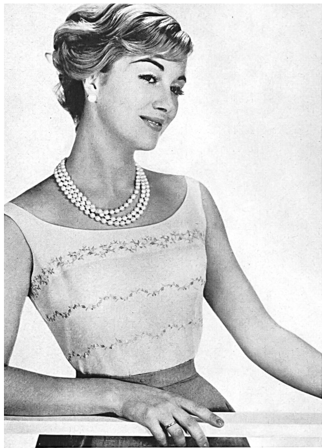
Modèle Ersä, Saarbrücken