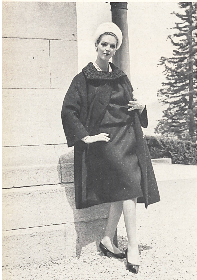
ARTHUR SCHIBLI S. A., GENEVE Robe noire avec manteau assorti Black dress with coat to match Vestido negro con abrigo haciendo juego Schwarzes Kleid mit passendem Mantel

rainwear, after-ski wear, winter sports clothes and beach wear. Later, while refreshments were being served, those present had an opportunity of examining a special display of lingerie; lunch was followed by another fashion parade, featuring coats, suits, two-piece outfits, dresses, knitted afternoon dresses, blouses and children's wear. Then it was tea-time, after which there was another presentation, this time of cocktail and evening dresses. The day was brought to a very enjoyable close with a cocktail party followed by dinner. Opposite we show some photographs taken at this highly successful event.