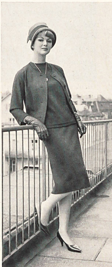
« SNAKY-BELFA » OUMANSKY & CO., GENÈVE Trois-pièces tricot Three-piece knitted outfit Tres piezas de punto