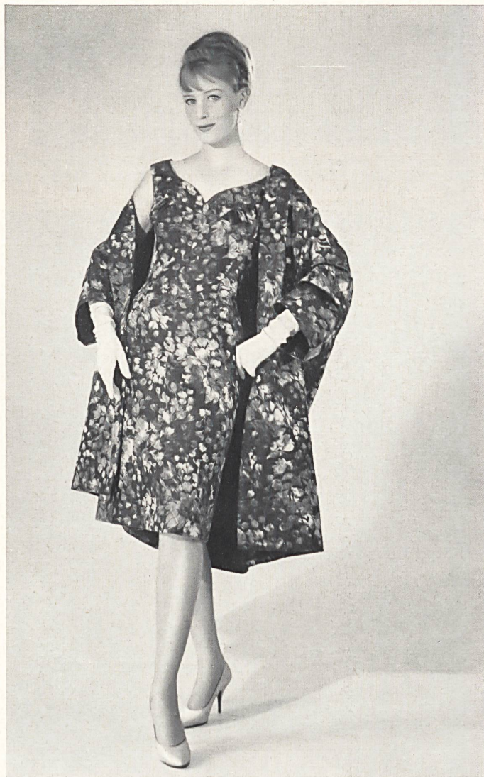
H. HALLER & CO., ZURICH Ensemble en jacquard pure soie Pure silk jacquard outfit Conjunto de tejido jacquard seda pura Complet aus reinseidenem Jacquard Gewebe