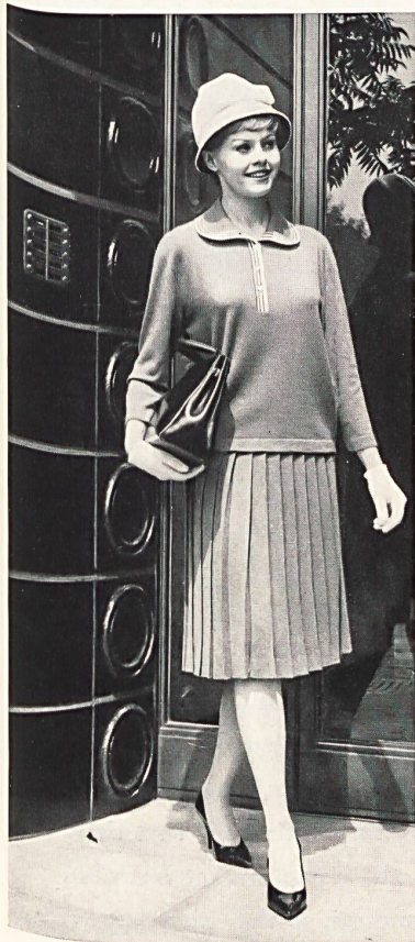
« ALPINIT » RUEPP & CIE S.A., SARMENSTORF Ensemble tricot Knitwear outfit Conjunto de punto