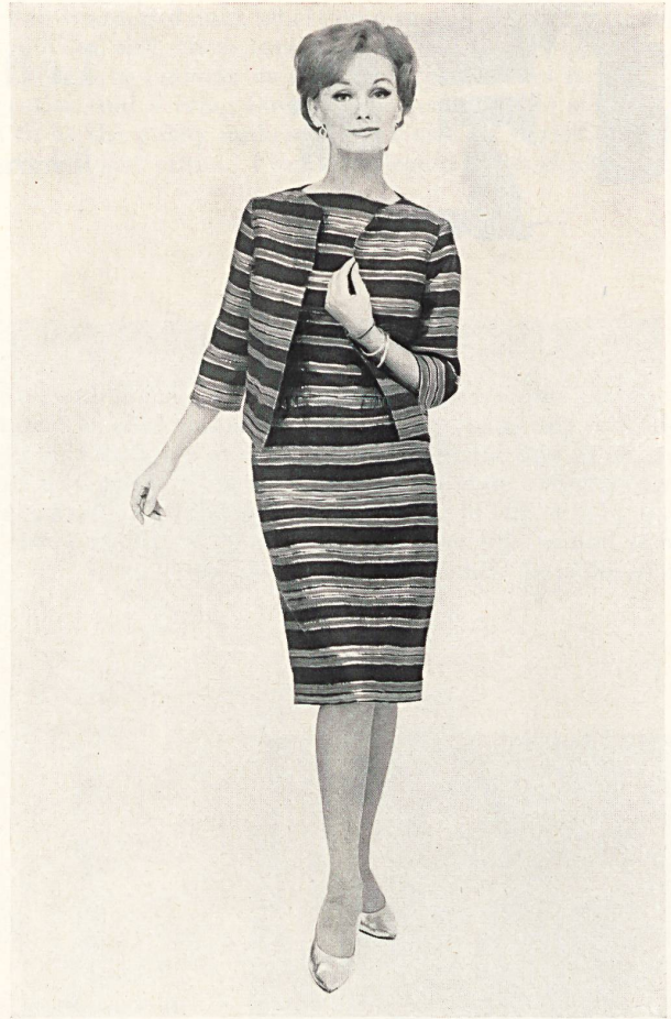
Jewels by Cartier, New York

Swiss cotton fabrics are no longer reserved exclusively for warm seasons and tropical climates. They are also extremely popular all over the United States for day and evening fall fashions, as these three photographs show :