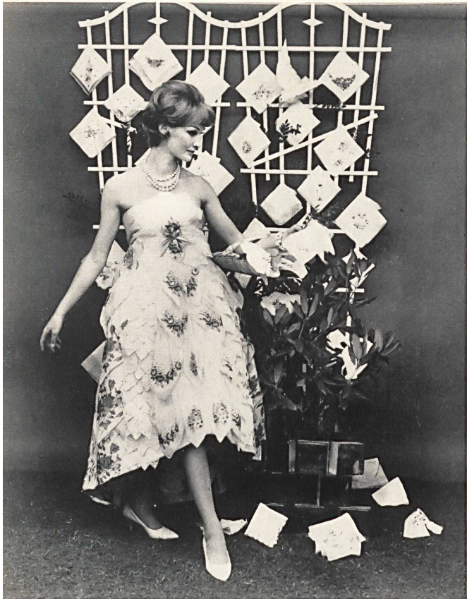
A Marianne Couture model, St. Gall, worked with approximately 120 handkerchiefs