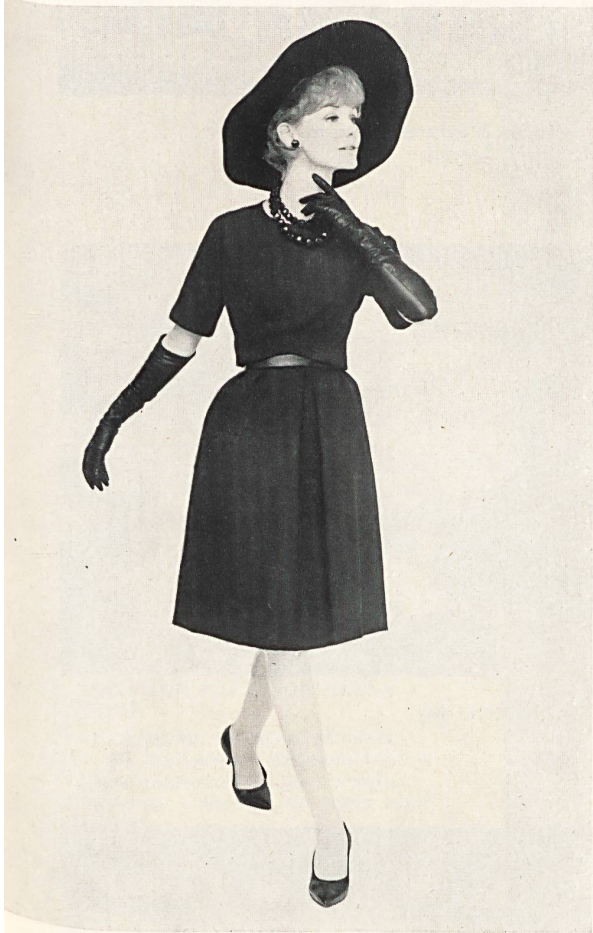
Black cotton fabric from St. Gall Teal Traina model, New York