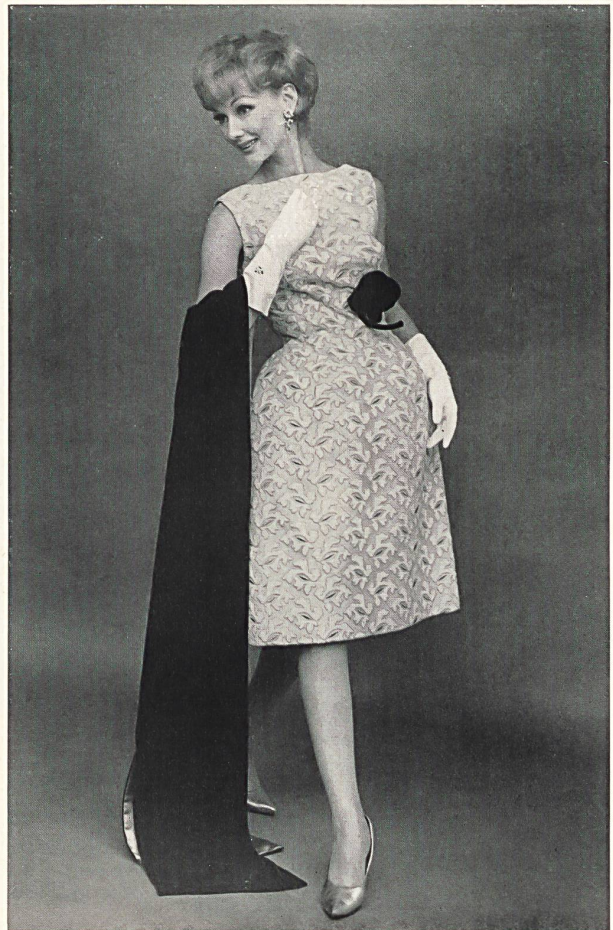
St. Gall Embroidery Burke-Amey model, New York