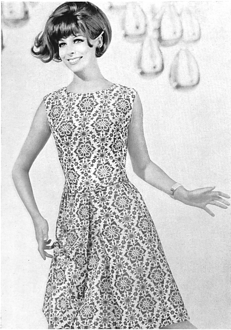
SOCIÉTÉ DE LA VISCOSE SUISSE, EMMENBRÜCKE Robe en jersey Pontesa imprimé, avec effets Lurex Printed Pontesa jersey dress with Lurex effects Vestido de jersey Pontesa estampada con efectos Lurex Pontesa-Jersey-Kleid mit Lurex-Effekt Modèle: « Blu*Nor » Lucien Nordmann, Berne