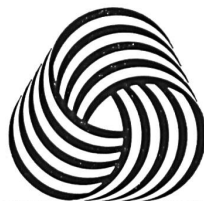
PURE LAINE VIERGE

IWS, the International Wool Secretariat, is a publicity organization supported by 200 000 wool producers in Australia, New Zealand and South Africa. Its aim is not so much to step up the use of wool, since the production of this fibre cannot be increased indefinitely, but to improve its wearing qualities and to make them known. At the same time, it tries to protect the reputation of high quality virgin wool against the harm that can be done to it by the use of low quality wool (more especially shoddy) whose properties no longer satisfy present-day requirements. This aspect of the work of IWS was dealt with at a recent press conference during which the main members of IWS's Zurich office presented to representatives of the Swiss press the new international label (see above) protecting products made of pure virgin wool. This label has already been registered in over 90 countries and is used for the moment as an indication of quality mainly for knitting wool, fabrics, blankets and carpets. Its use implies compliance with certain