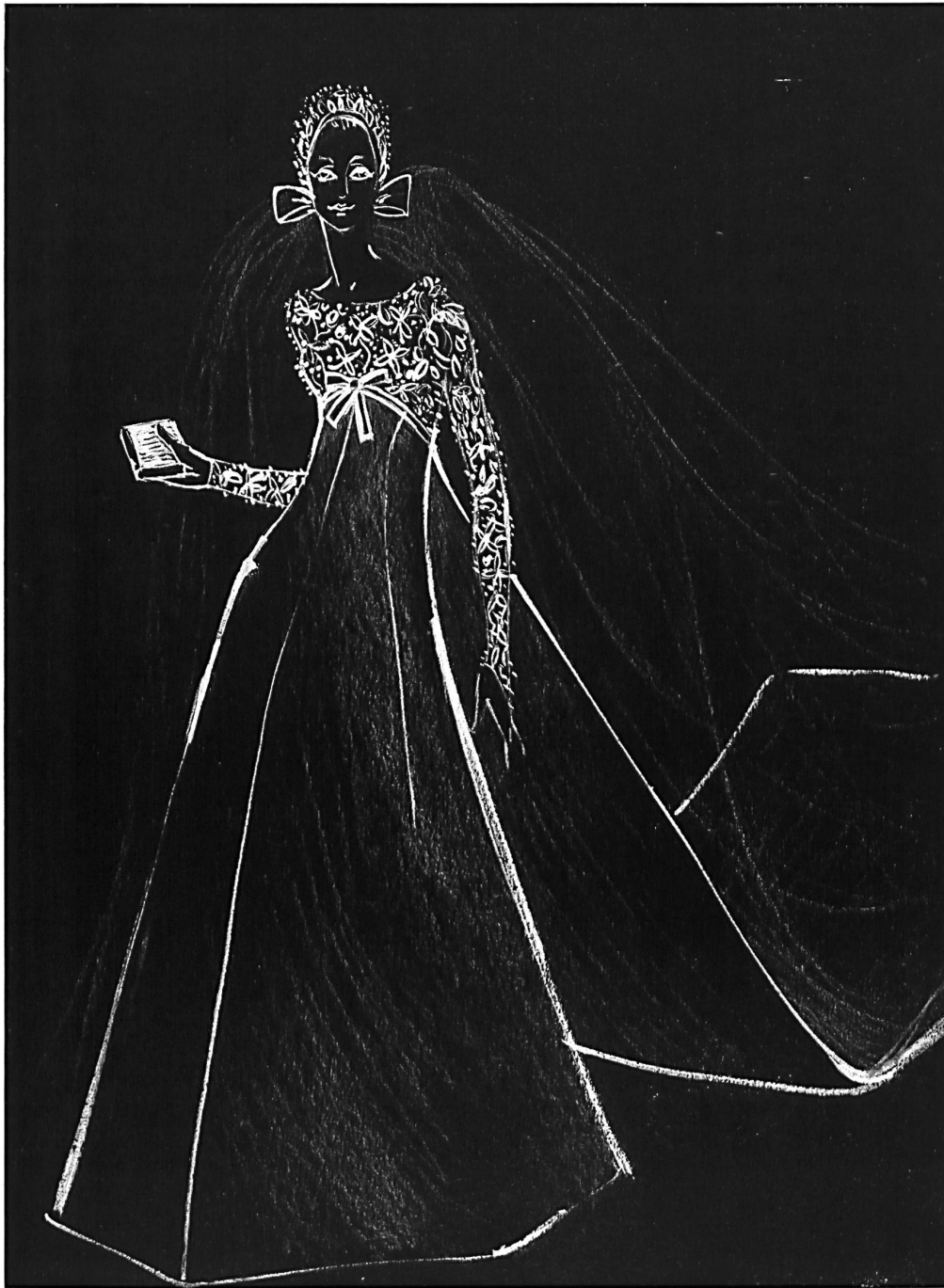
Magnifique robe de mariée; haut et manches avec applications de broderies de: Superb wedding gown; top and sleeves with superimposed applications of lace by: FORSTER WILLI & CO., SAINT-GALL Rahvis, London

need for lower prices in his second couture collection: a special series of useful chic ensembles which require one fitting only before they are delivered one week from the date of order. His Petit Salon, as usual, is stocked for the autumn with vivid rain defying suits and elegant little cocktail and dinner dresses. Brown is an elegant and smart colour. Hems are up at most of the top houses, and it's smart to wear black.