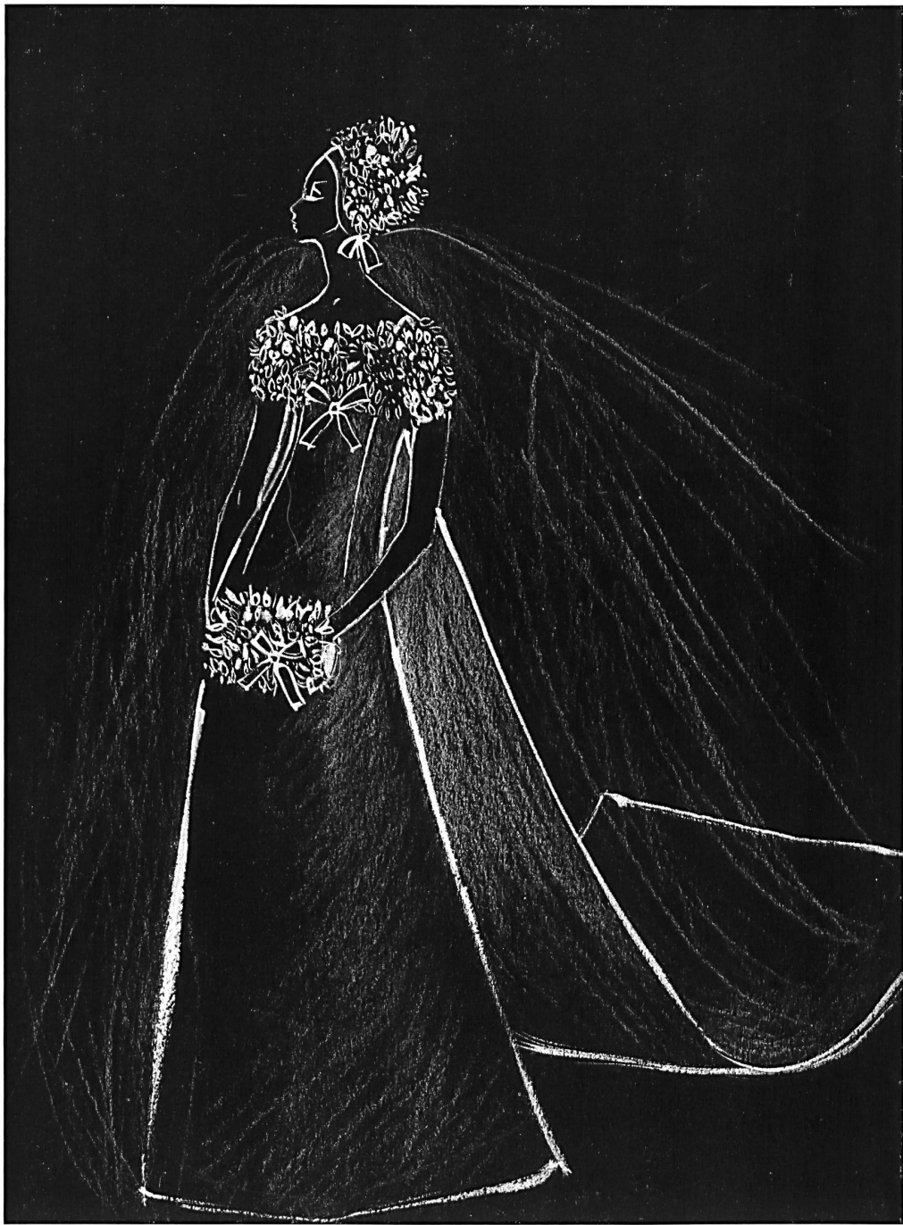
Robe de mariée en organza ivoire, avec guipure de: Bridal gown in ivory organza with guipure lace by: