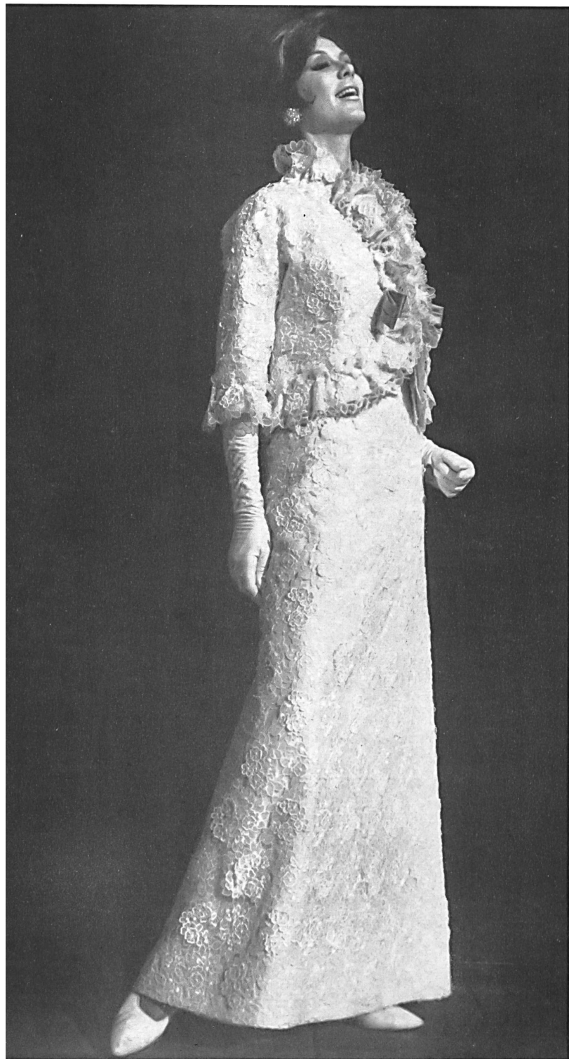
FORSTER WILLI & CO. SAINT-GALL Broderie avec applications sur organza de soie blanc Embroidered white silk organza with appliqué-work Modèle Michael Novarese, Los Angeles