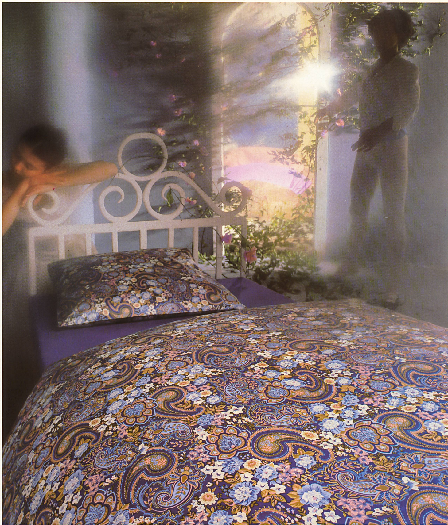
“Semiramis”, a typical example from the “Oriental Style” group in beautiful combinations of colour. The attractive floral paisley design stands out particularly well on the high quality cotton satin ground. Colour-matched to the “Muralto” and “Mayfair” shades, it is combined here with a “Jersey/Stretch” fitted sheet in “Muralto” marine.