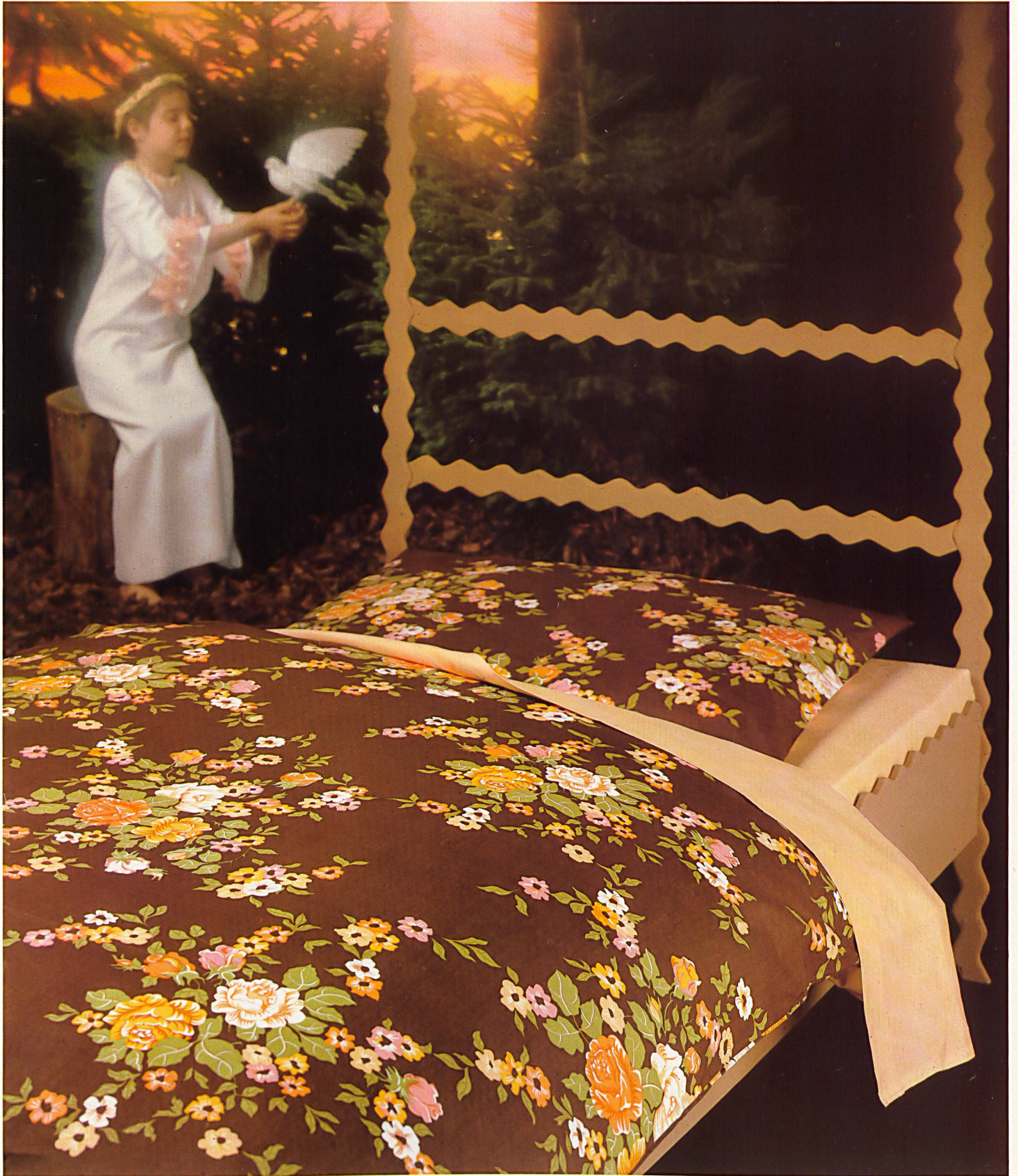
Lovely floral design in bright colours on a dark ground. The percale covers are shown with the colour-matching percale sheet and a "frotté" fitted bottom sheet.