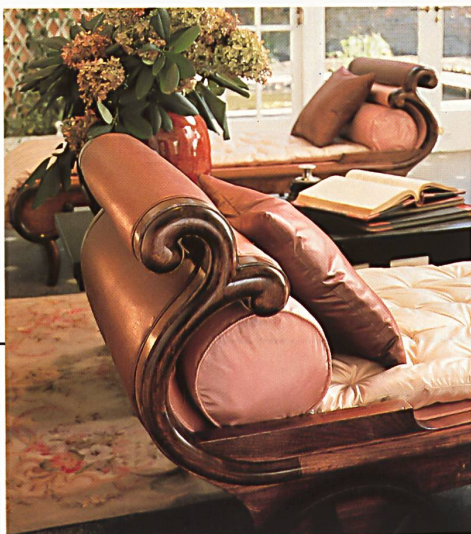
Oriental glazed silk chintzes and cotton matelassé from Zumsteg shown in settings designed by Scruggs/Myers.

Allen Scruggs and Douglas Myers set up shop in 1976 and recently moved from New Jersey to a loft in New York's Chelsea area. Their academic schooling focused on art and interior design. Past experiences include designing of theater sets, furniture and textiles as well as journalism and lecturing. Both did displays and model rooms for department stores. Scruggs and Myers have an affinity for luxurious interiors and very modern concepts. They are extremely versatile in their creative work for private residences and corporate settings. Their interior designs have been widely publicized by national magazines.